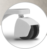
Castor wheels Easy to move around

Our range of Metal Panel Heaters come with easy to install mounting brackets and casters for a choice of a fixed or permanent heating solution.