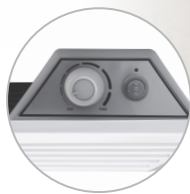
Adjustable thermostat Regulate your level of warmth